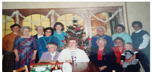
1990. Beverly Unit Christmas gathering at a Quincy restaurant