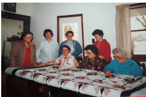
1985 Members of Beverly Home Extension enjoy working on a quilt together.