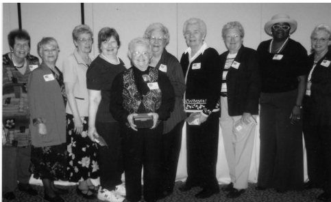
The 2007-08 McHenry HCE Board L to R: