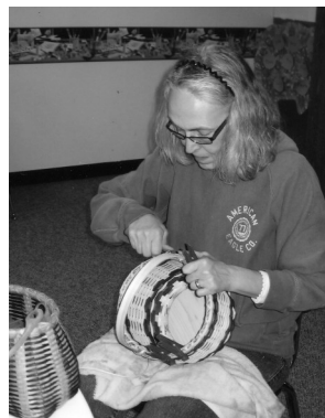
Completing her Smoke Joe Basket

These classes were held to make bracelets, raviolis, baskets, crafts and jewelry, quilt runners, candy, braided bread, cinnamon rolls and painting. Participants also learned about osteoporosis, knitting, gardening, Bonsai trees and appetizers. Everyone enjoyed this all day event and many new ideas are already being planned for next year.