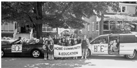
EDGAR COUNTY JOINS THE "PARADE TRAIL"!

Some of the members walk, while others ride in decorated cars. Five free memberships are handed out at every parade and several people have taken advantage of them to join their local unit. Our county banner is carried in front of the group. Scattered among the walkers are members wearing our purple aprons with the HCE logo on them. Purple balloons can be seen bobbing above, and our HCE song can be heard all along the parade routes.