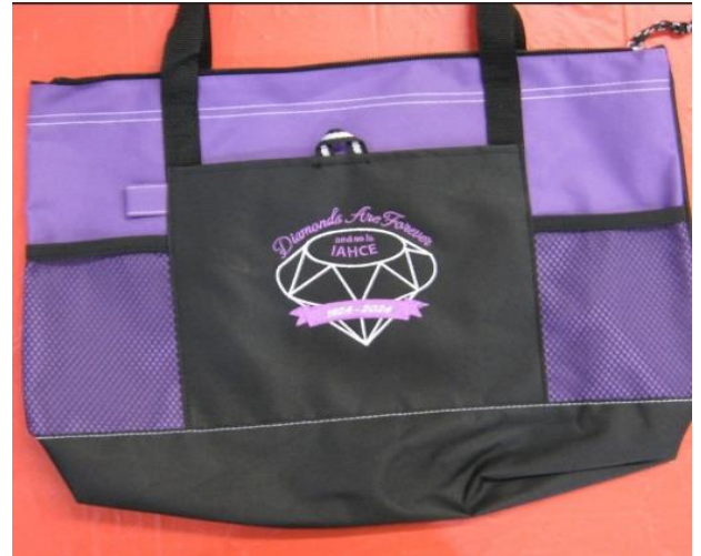
IAHCE 2024 100 th Tote Bag