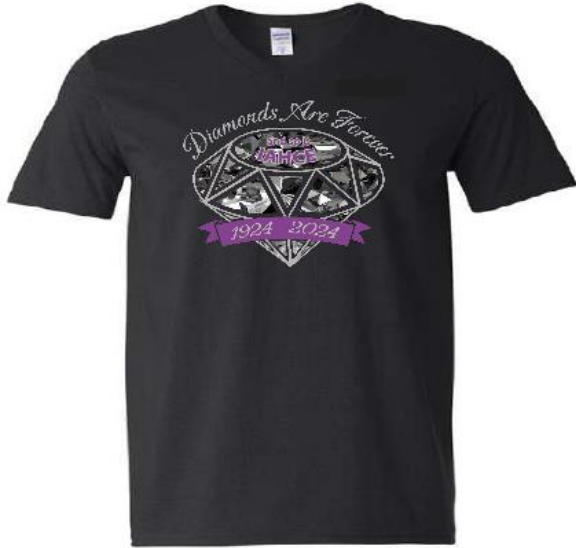
IAHCE 2024 100 th T-shirt

These items can be purchased on your registration form. Items will not be shipped so you will have to have someone pick them up at conference if you are unable to attend.